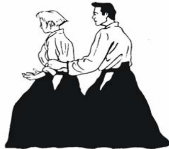
Ushiro ryohiji dori