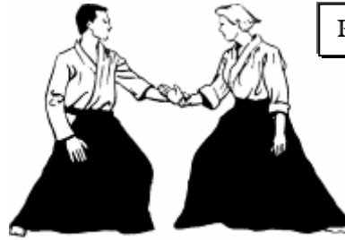
Katate dori (Gyaku hammi)