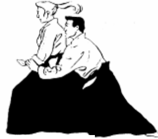
Ushiro ryote dori