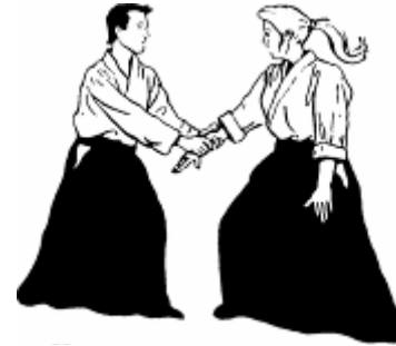
Katate ryote dori (morote dori)