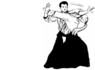
Sokumen irimi nage (Naname kokyū nage)