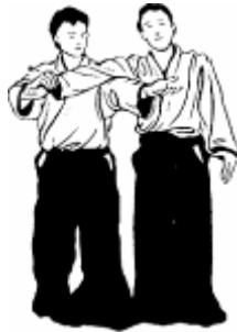
Ude kime nage