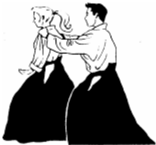
Ushiro ryokata dori