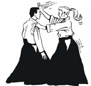
Kata dori men uchi