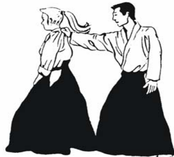
Ushiro eri dori