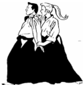
Ushiro katate dori kubi shime